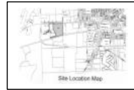
(P & P location map)

The site was drained and farmed in the 1940s through 1960s as part of the state-run Oakdale Center for Developmental Disabilities complex. The 35-acre project site is located south of Oregon Road and west of Millville, within two miles of six elementary schools and adjacent to the Chatfield School and Mott Community College campus. A 40-acre wooded site and a 100-acre riverbed area on the former Oakdale property have been designated for future natural habitat preservation.