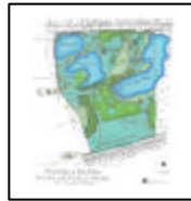
(P & P site plan)

Prairies and Ponds at Oakdale is a natural habit restoration and preservation effort by a team of citizens groups, federal and local agencies and nonprofit wildlife advocates.