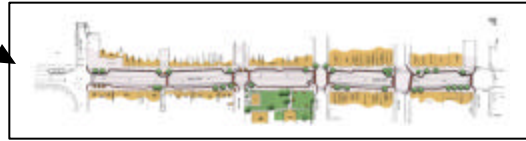
(Downtown site plan)

Phase 2 of downtown's revitalization project is nearly complete. New water main and electrical lines have been installed along Nepessing Street, and five bays of angle parking have been added. Landscape planters, benches and historic street lamps will be completed in time for Lapeer Days. Gateway entrance statements will be constructed at key entrances to the downtown area, and will feature cupolas salvaged from the historic Oakdale buildings and directional signage.